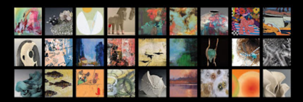
Upstate Artists | December 4 - January 9

What better way to start the new year than to catch up with an art show or two that you meant to see but got too busy to get to during the holidays.