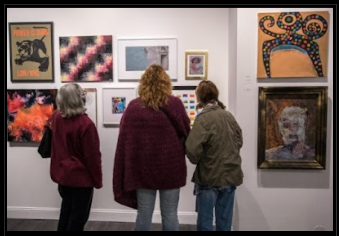
The Annual Members' Show at Albany Center Gallery is always a crowd-pleaser